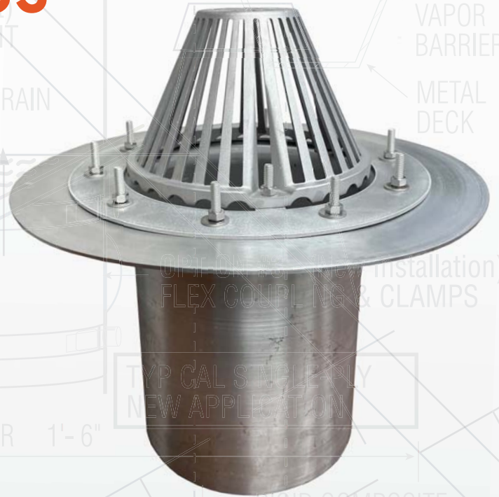
W/ 10" Aluminum Dome and no expanding tape