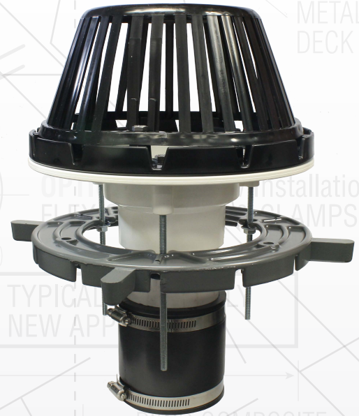
ECONOMY ENPOCO PAK ROOF DRAIN